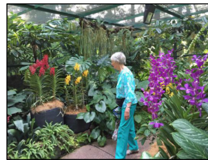
Singapore Orchid House

Note: these examples are not representative of the scale of the proposed structure. The proposed building will be considerably smaller