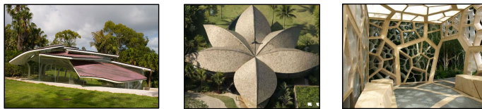
Examples of organic shaped roofs and buildings