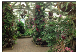
Mackay Orchid House